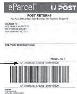
Sample: POST RETURNS label

Returned materials without an “AP Article Id” either placed on the box or not recorded will not be trackable unless sent as Registered Post.